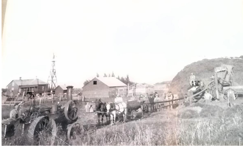
Threshing team near Dows, Iowa